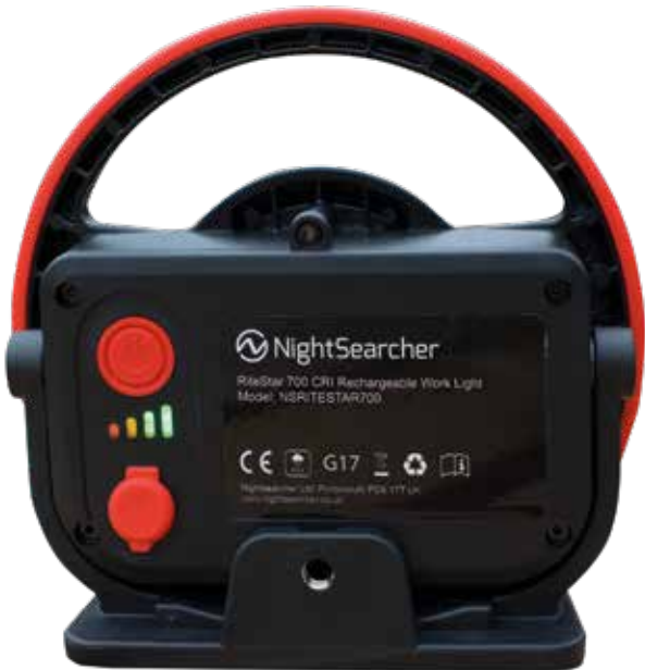
Battery charging and status indicator