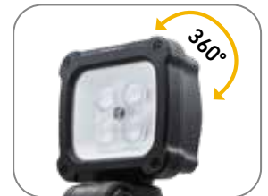
Swivel light head