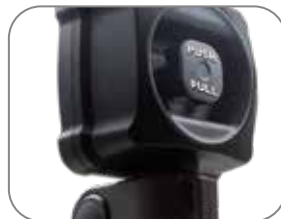
Spot to flood beam Simple push - pull