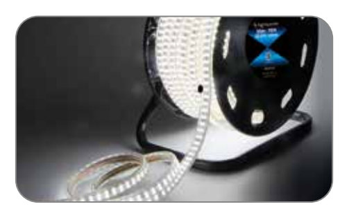
Ideal for use in areas where access egress needs to be illuminated