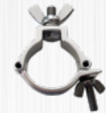
Optional scaffold bracket