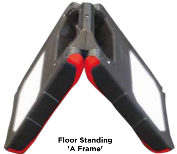
Floor Standing 'A Frame'