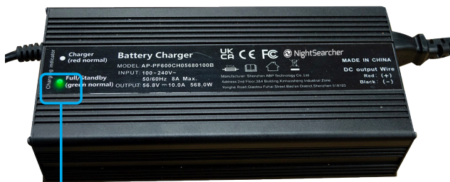
●● Battery Charging Indicator