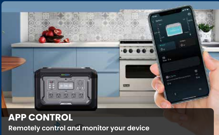
APP CONTROL Remotely control and monitor your device