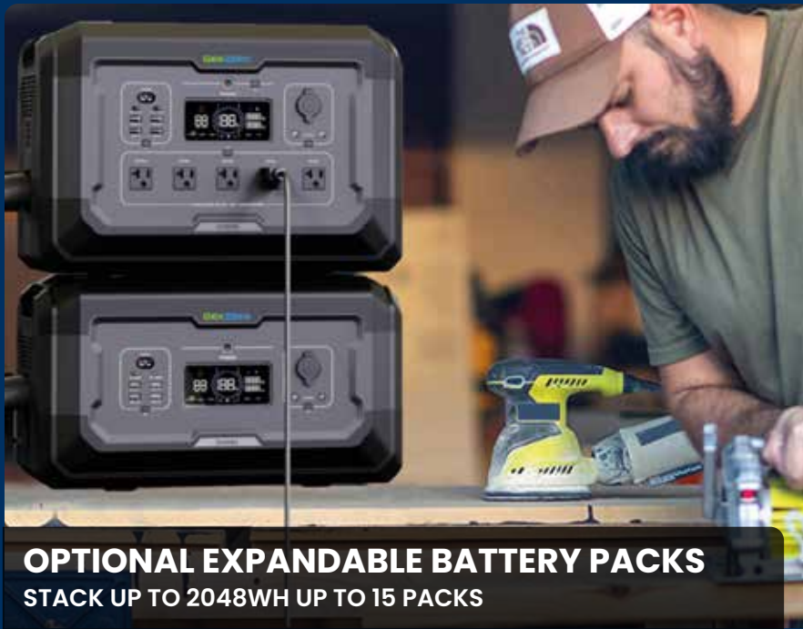
OPTIONAL EXPANDABLE BATTERY PACKS STACK UP TO 2048WH UP TO 15 PACKS