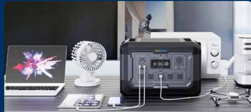
UPS FUNCTION Charge multiple devices during a power outage