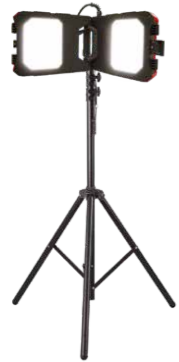
Optional tripod available SPTRIP0D2.3