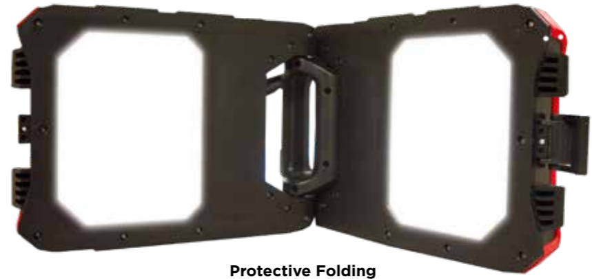
Protective Folding Case Design